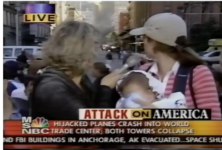
Ashleigh Banfield and Lower Manhattan resident turn toward WTC 7 roughly 650 meters to the south.

The third video clip reviewed was a second street interview being conducted at West Broadway and Leonard Street. This camera was located . . . roughly 650 m (2100 ft) from WTC 7 . . . . Review of the interview clip showed that people in the video responded to the WTC 7 collapse . . . 1.3 s after the east penthouse began to descend into the building. Allowing 2 s for sound to reach the camera location, this is very close to the time that the east penthouse began to descend. People at this location were able to hear the collapse of the east penthouse , while observers on West Street did not hear loud noises until the global collapse started. (Emphasis added.)