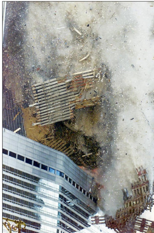
WTC3 during the collapse of Tower 2, where it is about to be hit with large heavy debris raining down on it.

After the collapses of the towers Bldg. 3 exhibited a large vertical slash through it and Bldg. 6 a large vertical hole. The photos below show WTC3 during and after the collapse of Tower 2 and WTC6 after the collapses of both towers.