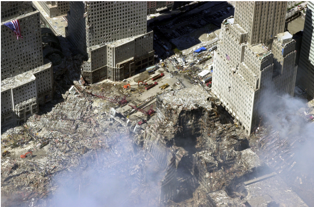
WTC6 after the collapses of the Twin Towers exhibiting heavy damage to three sides of the building, deepening in the center. Aerial views from directly above can be misleading as they make it appear as though the building simply has a hole in it.