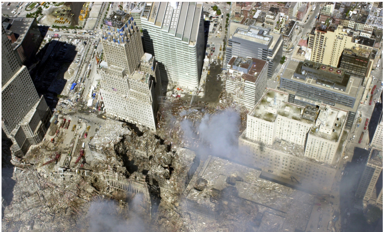
WTC6 (at lower left) and WTC5 (at lower right) after the collapse of both towers

Of course, the antenna mast wasn't the only thing falling from great height that day, as it is obvious from the photos that there were many huge pieces of structural steel falling on the immediately adjacent buildings. The damage to WTC Bldg.'s 3 and 6 was part of the original argument for the theory that a beam weapon was responsible for the destruction on Sept. 11, 2001 in Lower Manhattan. Recently the damage to the other two immediately adjacent buildings, WTC Bldg.'s 4 and 5, has been used in attempts to bolster that theory and so deserve mention here and are the reason I have updated this letter.