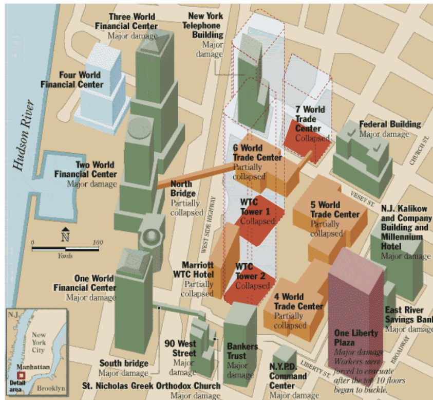
Layout of the World Trade Center complex

For some perspective take a look at where WTC3 (the Marriott hotel) and WTC6 were located in the complex, as shown in the plan view below, with the towers and Bldg. 7 only shown as silhouettes and footprints.