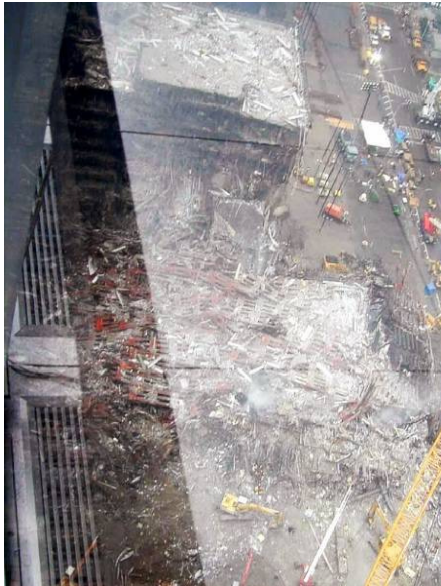
A close up of WTC4, after the collapses, exhibiting the tower perimeter beams. Judging by the vehicles in the street, the debris height appears to be two to three stories high.

Due to its close proximity and what is seen in the photos above, it appears that a whole wall of the South Tower fell on the completely collapsed portion of Bldg. 4. If one does the math for the potential impulsive loads, generated by the collision of the parts of that wall with the building, it will show that the load from that hit could be imagined as the building having a couple of aircraft carriers being placed on it. The impacted area of the building would surely collapse to the ground with that kind of load imposed on it, and that is what we see.