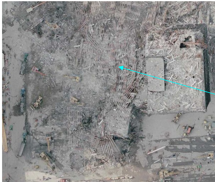
What is left of WTC4 showing a huge amount of the familiar tower perimeter beams, which obliterated half of the building. (blue arrow points to the perimeter column steel being discussed)